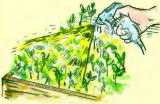
Spray Drip Down

Mix with Water to Make IBA Rooting Solutions Use by Foliar and Basal Methods