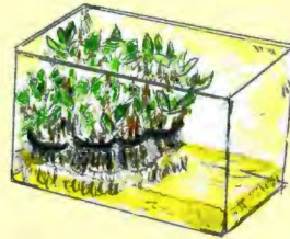
Basal Long Soak

Technical Support & Articles: rootinghormones.com